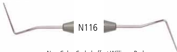
Non-Color Coded offset Williams Probe 1-2-3-5-7-8-9-10