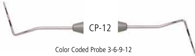
Color Coded Probe 3-6-9-12