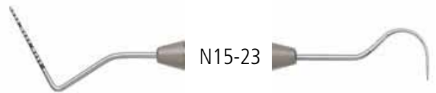
Color Coded University of North Carolina 1-2-3-4-5-6-7-8-9-10-11-12-13-14-15 with #23